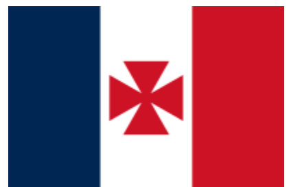
Uvean flag between 1860 and 1896

April 5, 1887 the island became a French protectorate after queen Amelia Tokagahahau Alik signed a treaty with France but keeping her royal powers.