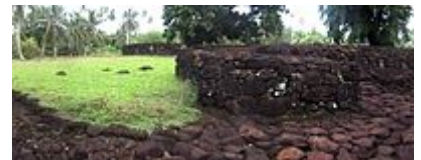
Talietumu archaeological site

'Uvea has probably been inhabited by Polynesians since the 15th century CE and was then part of the Tu'i Tonga Empire . The two archaeological sites of Talietumu and Tonga Toto are remains from that period.